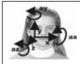
Figure 3: Orientation of the coordinate system. ax , ay , az mark the rotations around the x , y , z axes, respectively.

The faster movements, on the other hand, are closely related to the prosody of the text. Accents are often underlined with nods that extend typically over two to four phones. This pattern is clearly visible in Figure 4a. Here the nods are very clearly synchronized with the pitch accents (positive values for angle ax correspond to down movements of the head). Typical for visual prosody, and something observed for most speakers, is that the same motion - in this case a nod - is repeated several times. Not only are such motion patterns repeated within a sentence, but often over an extended period of time; sometimes over as much as whole recording session, lasting about half an hour.