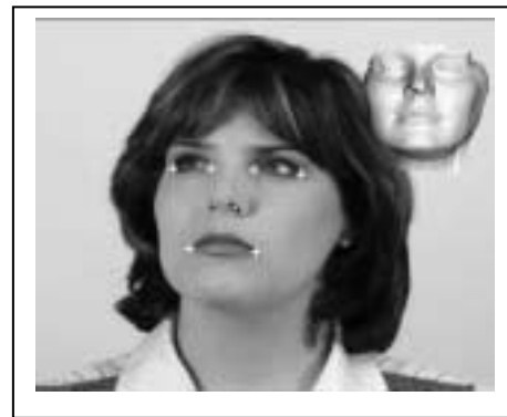
Figure 2: Feature points identified in the face. The head pose is calculated from the eye corners and the nostrils. The 3-d face model is shown in the same pose as the recorded face.

Beside the head pose we focus on the positions of the eyebrows, the shape of the eyes and the direction of gaze. These facial parts move extensively during speech and are a major part of any visual expression of a speaker's face. They are measured with similar filters as described above. They do not need to be measured with the same precision as the features used for measuring head poses. Whether eyebrows move up one pixel more or less does not change the face's appearance markedly.